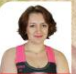
Hannibal Wrecked-Her TURN COACH