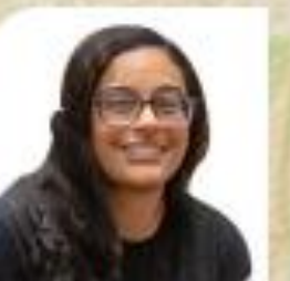
Mai Tai 44