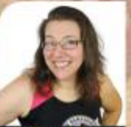
Penalty Bex 40