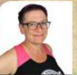
Stormy Heather 247