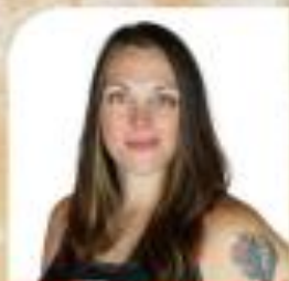
Jagged Little Kill 87 C