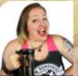
Irate Pirate 100