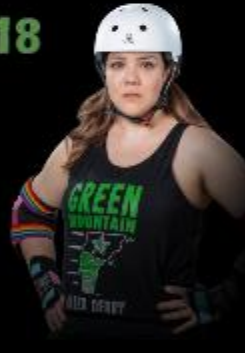
HELL O. KITTY