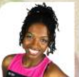
Jukey Fruit 404