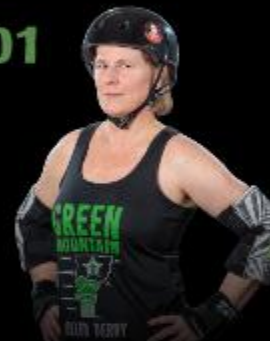
BITTER BLONDE AILMENT