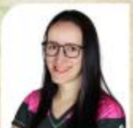
Death Star 6