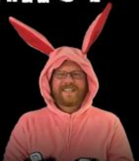
POPE JOHN MAUL III