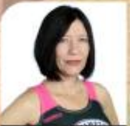
Erin Go Brawl 317