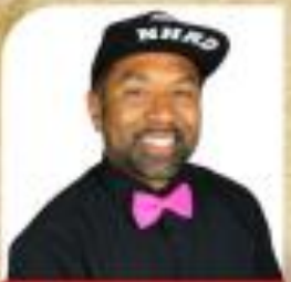
2Pack Shocker COACH