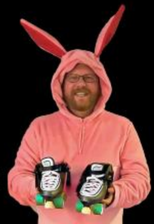
POPE JOHN MAUL III