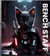
BENCH STAFF DARTH BRAWL