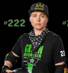
SOCK O PATH