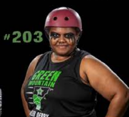
SHIVHER & SPYCE