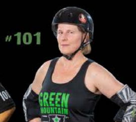
BITTER BLONDE AILMENT