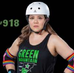
HELL O. KITTY