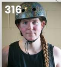
SHAKESQUEER IN THE SKATE PARK